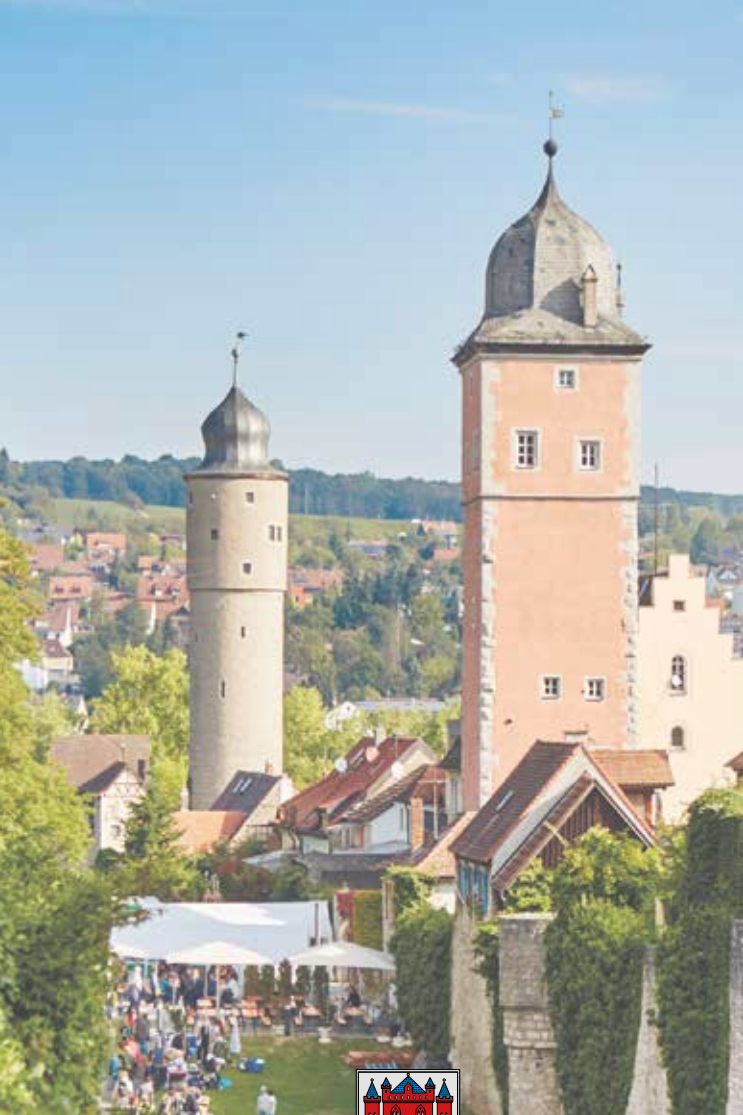
© Stadt Ochsenfurt 01/2025, Design: Konrad Grimm, Dipl. Designer (FH), Fotos: Stadt Ochsenfurt, Konrad Grimm